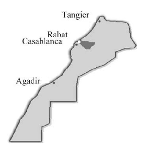
Fig. 1 Location of Rabat Province (dark shading), Morocco

In Morocco, free health care is provided for all people in public hospitals. There is a total of five public hospitals (two university centers and three regional hospitals) located throughout Rabat Province. Most residents of Rabat Province with hip fractures are treated at one of the five public hospitals. Patients who present to another facility are automatically referred to one of these five hospitals. All hospitals are the biggest in their area and situated in the center of town, serving the total population from all social groups and all ages. In each hospital a register is maintained in the inpatient department of all patients who are admitted, and it includes the date, the patient's name, age, and gender, diagnosis of the fracture, and the patient's home address. The admitting doctor is responsible for making the assessment, using both a clinical and a radiological examination, before the entry in the register is made. In addition, there is a medical records office in each hospital, where the original medical records of patients are